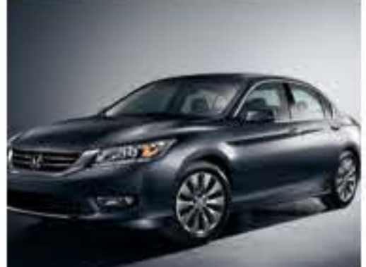
2013 Honda Accord: A napping giant awakens