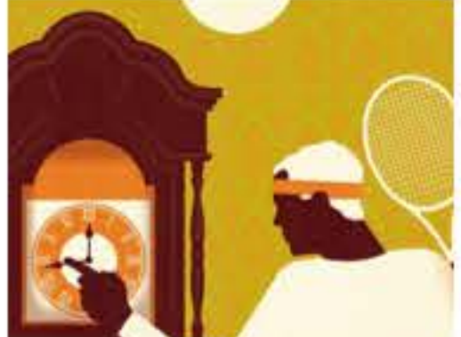
Aging healthfully is not just a matter of having good genes