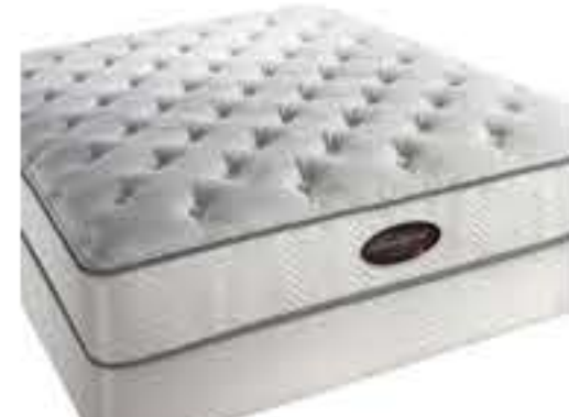
Handy Guide: Buying a Mattress